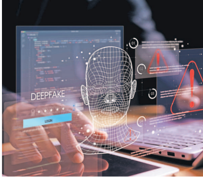
AI tools can generate highly convincing deepfake videos and voice clones, making it difficult to trace and remove them, especially across multiple platforms.