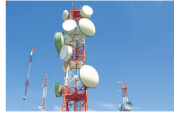
Aggressive bidding for spectrum has eased since 2021, with most of the airwaves sold near reserve prices.

nomie Affairs, while approving the auction results for the auction in 2024, had asked the telecom regulator to examine the demand and supply dynamics and explore the possibility of enhancing competition and mitigating oversupply of spectrum.