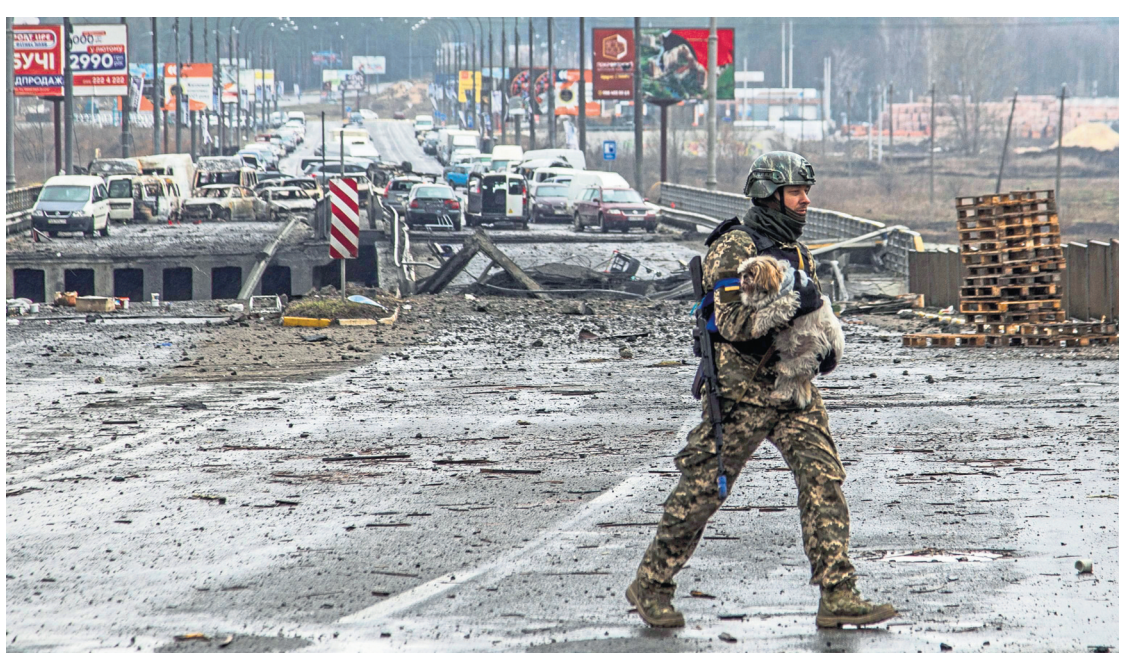
A Ukrainian service member carries a dog next to a bridge over the Irpin river, as Russia's attack continues.

In Ukraine's east, an area long coveted by Moscow, Russia has been intensifying attacks. Russian forces have been attacking the city of Lysychansk for the past two days. Shelling by Russian troops killed at least seven people and injured dozens