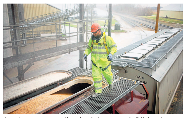
A worker prepares a railroad grain hopper car in Edinburgh,